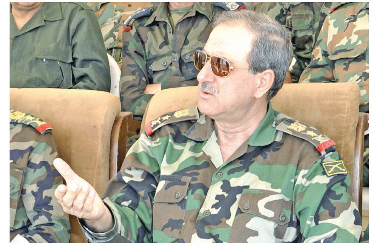
VIOLENT END: Daoud Rajha, a Christian, was defence minister, deputy army chief and deputy of the Council of Ministers.

Columns of black smoke rose over the capital, with the Local Coordination Committees, which organises anti-regime protests on the ground, reporting that Qaboon