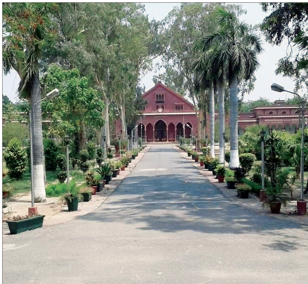
A general view of the Sir Syed Hall (South) of Aligarh Muslim University.