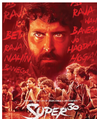
A movie poster of Super 30.