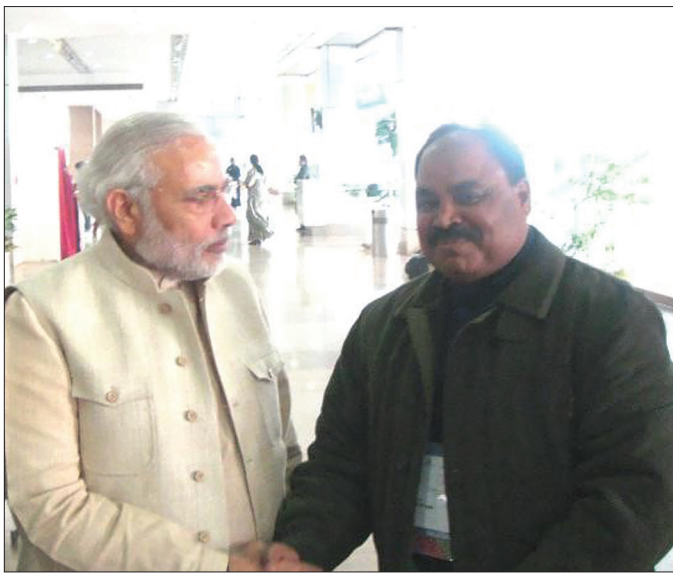
Nabi with Indian Prime Minister Narendra Modi during a visit to India (File photo).