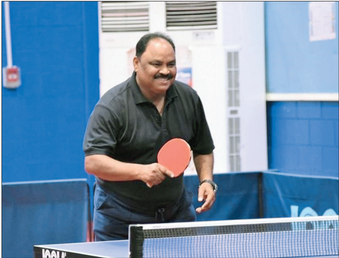
Enjoying a game of table tennis in Doha.